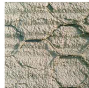
Stucco Mix 2 Building Paper