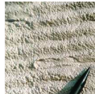
Stucco Mix 2 Tyvek® StuccoWrap®