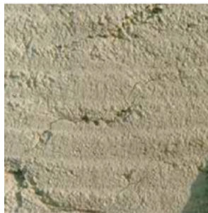
Stucco Mix 1 Tyvek® StuccoWrap®