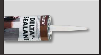
DELTA ® -SEALANT elastic sealing compound used at overlaps and penetrations.

DELTA ® is a registered trademark of Ewald Dörken AG, Herdecke, Germany.