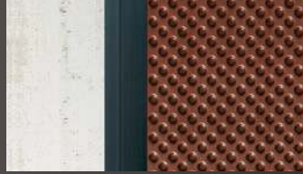
DELTA ® -MOLDSTRIP molding used around window cut-outs and at grade level/changes.