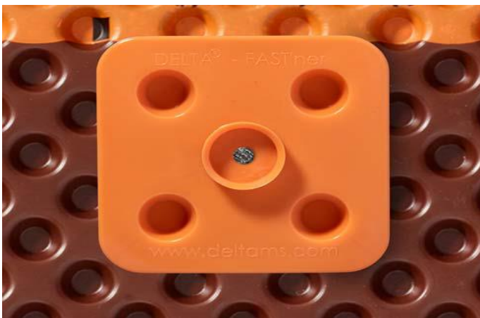
Figure 3. “DELTA®-MS” dampproofing membrane – anchor