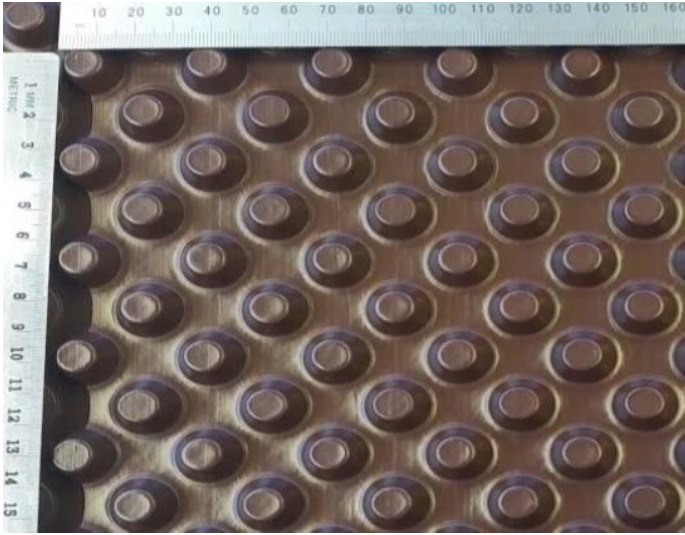
Figure 2. “DELTA®-MS” drainage membrane – face in contact with the wall