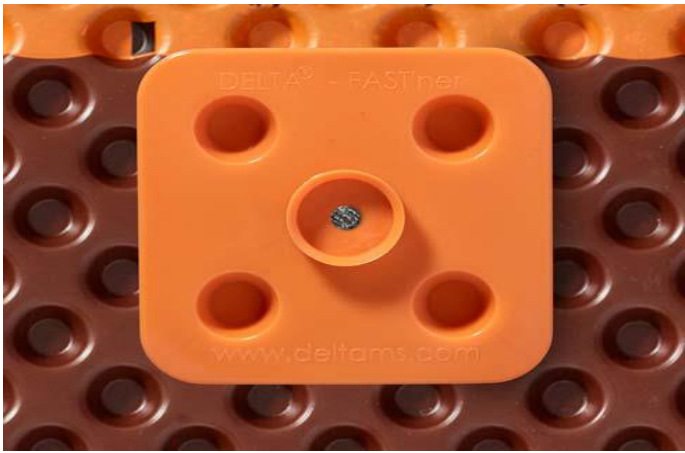
Figure 3. “DELTA®-MS” drainage membrane – anchor