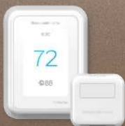
T10 PRO SMART THERMOSTAT