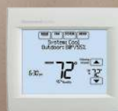
VISIONPRO® 8000 SMART THERMOSTAT