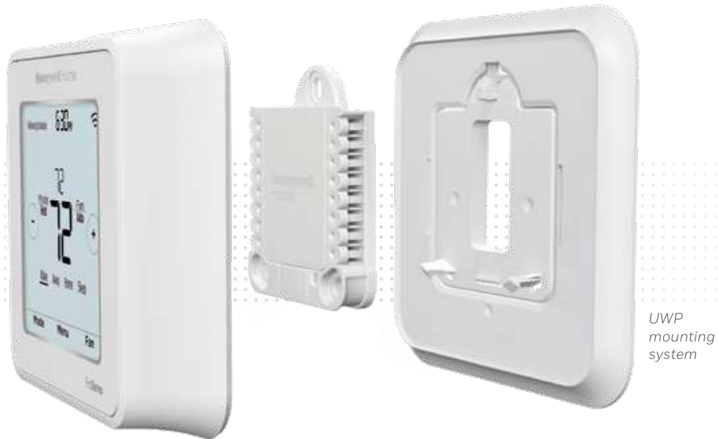
UWP mounting system