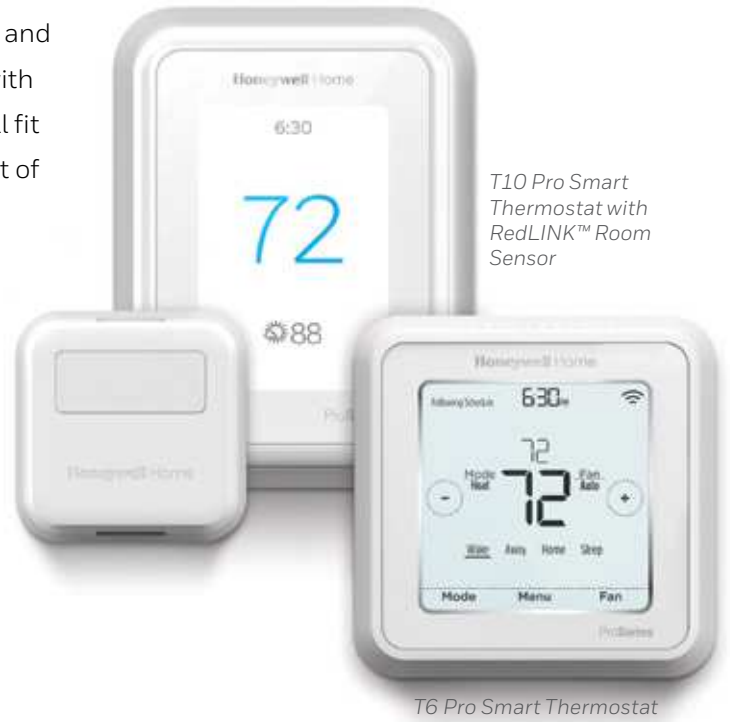
T10 Pro Smart Thermostat with RedLINK™ Room Sensor

With the T10 Pro Smart, you can control one humidification, dehumidification or ventilation solution, and with the T6 Pro Smart, you can choose optional ventilation control and dual fuel.