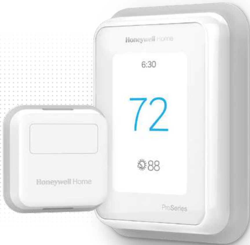
T10 Pro Smart Thermostat with RedLINK™ Room Sensor

Meet the next generation of everyday comfort solutions.