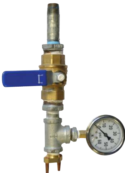
Figure 1: Flow test assembly

The pressure gauge is also critical should troubleshooting be necessary. (Refer to the Troubleshooting section on the back of this instruction sheet for further information.)