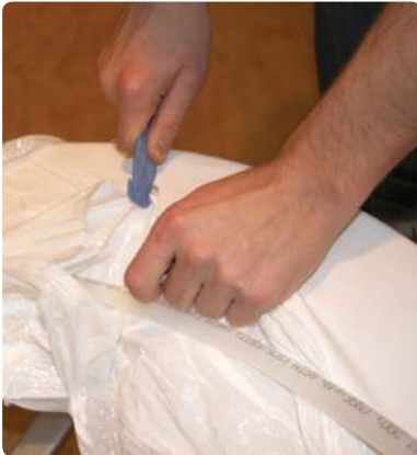
6. Once you reach the end of the coil, cut the stretch film.