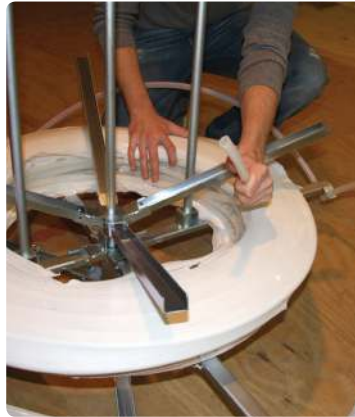
4. Find the end of the tubing in the center of the coil.