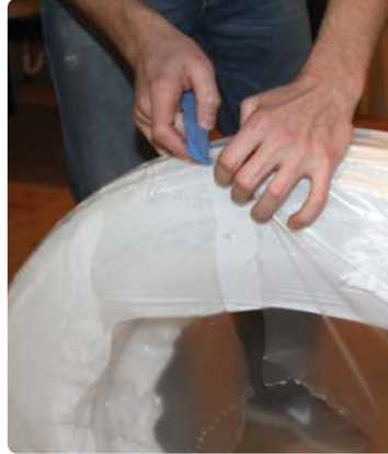
2. Using an Uponor-approved safety cutter (see page 2 ), remove the outer clear plastic layer. Note: Do not remove the inner white plastic layer.