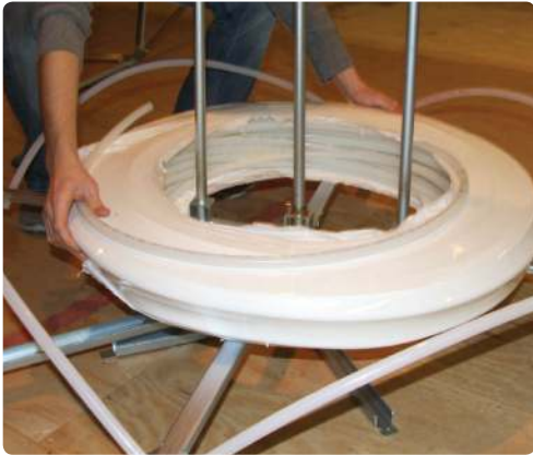
3. Place the coil on the Uponor Uncoiler.