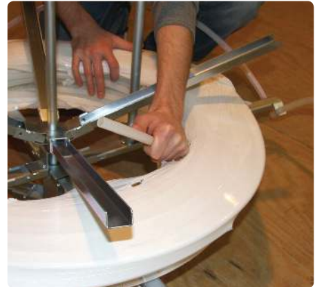
(Optional) When done, if there is still stretch film on the coil, push the unused tubing back into the packaging, and carry the coil to the next project.

Uponor, Inc. 5925 148th Street West Apple Valley, MN 55124 USA Tel: 800.321.4739 Fax: 952.891.2008