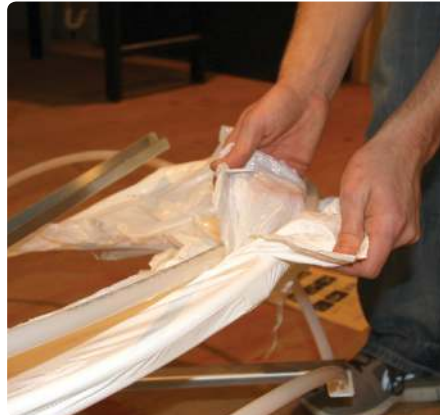
7. Remove the stretch film by separating layers binding to the tubing.