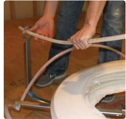
5. Feed the end of the tubing through the eye of the uncoiler and remove needed tubing for installation.