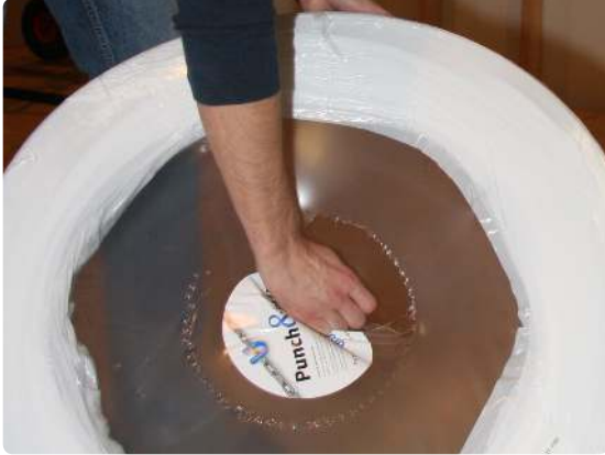
1. Punch through the plastic perforation in the center of the coil.