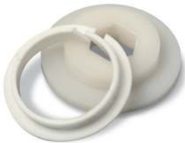
Two-piece bearing for long life and quiet operation.