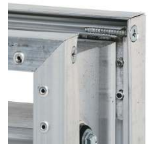
Durable construction — riveted and screwed corners.