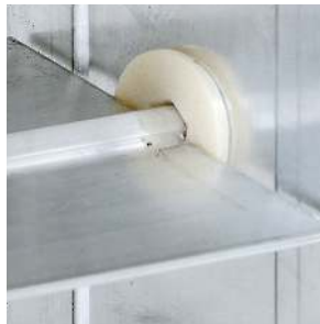
Parallel blade with extruded lip for low leakage.