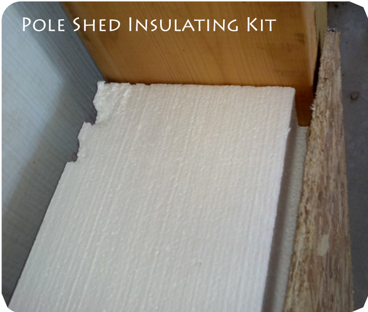
POLE SHED INSULATING KIT

Without disrupting the exterior of your shed, retrofit panels applied to walls and/or roof will: