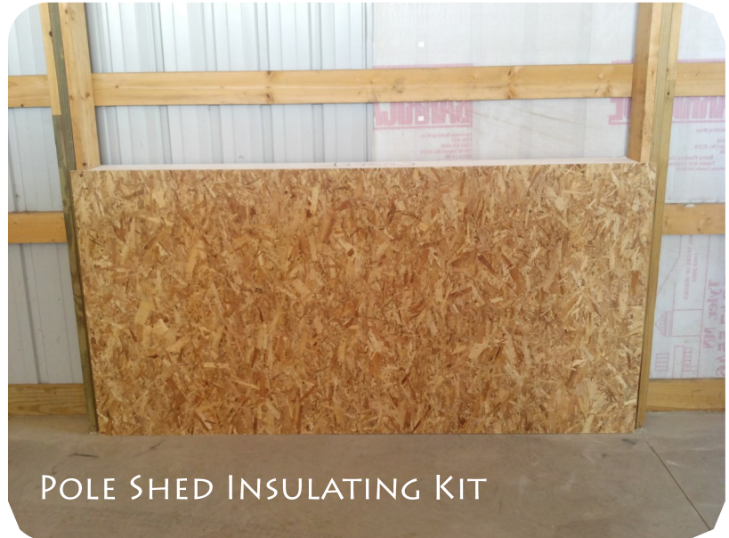
POLE SHED INSULATING KIT