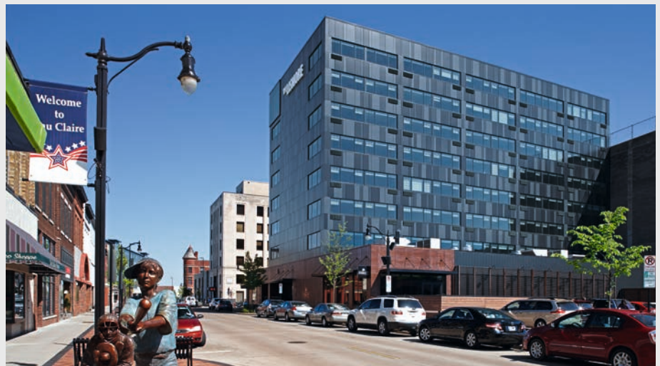
The redeveloped downtown Eau Claire

The owner, Pablo Properties, wanted the new hotel to be an asset to the downtown area and compliment the vibrant Farmers Market neighborhood. The Lismore features vintage hotel rooms and contemporary design that emphasizes a modern appearance while staying true to the Eau Claire community. The redesigned hotel will bring a new restaurant, coffee shop and bar to the downtown area.