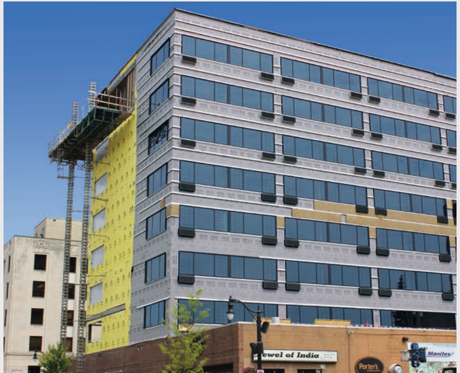
The owners chose fully adhered DELTA®-VENT SA for a higher level of air and moisture control

When the owners and RSP Architects were designing the property, they paid an extra level of attention to controlling the air and moisture in the building envelope. They were concerned about