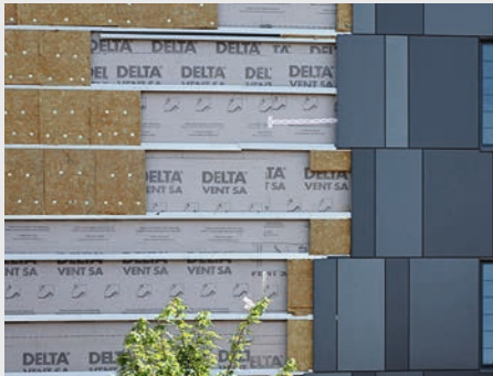
Installation of rainscreen cladding

The owner's goal is to create a first class experience for the people of Eau Claire as well as visitors to their community, and they made a huge investment to ensure that they do it right. General contractors Market & Johnson stated that "The hotel is undergoing a major renovation and transformation. Every surface in the hotel will be rebuilt with new materials."