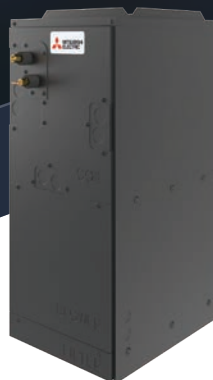
SVZ Multi-position Air Handler