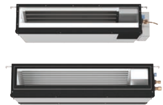
SEZ/PEAD Horizontal-ducted Indoor Unit