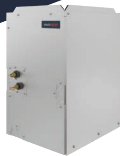
intelli-HEAT™ Dual Fuel System