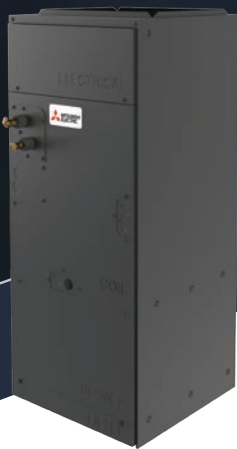
PVA Multi-position Air Handler